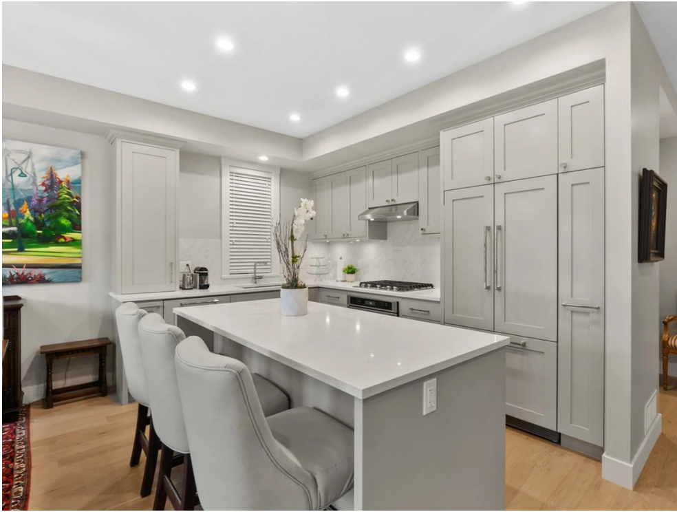
Quartz countertops and top-of-the-line stainless-steel appliances in the kitchen at unit 1, 236 West 18th Street, in North Vancouver.

Weekly roundup of three properties that recently sold in Metro Vancouver.