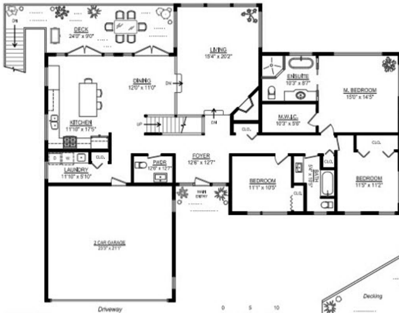
MAIN LEVEL Area: 1958 sq. ft.