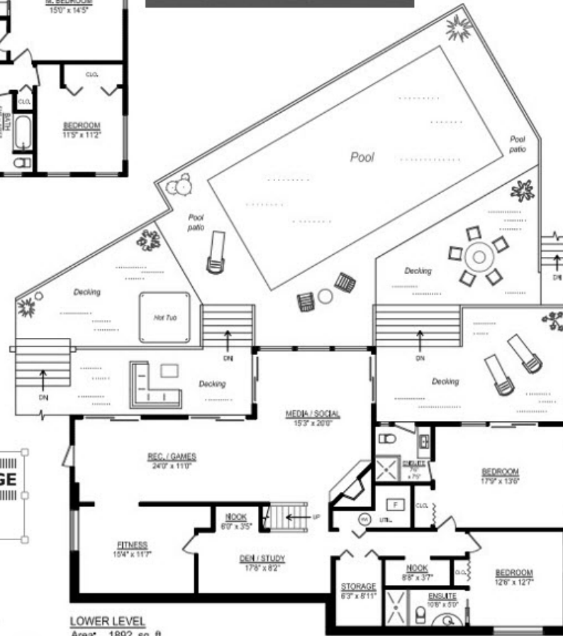
LOWER LEVEL Area: 1892 sq. ft.