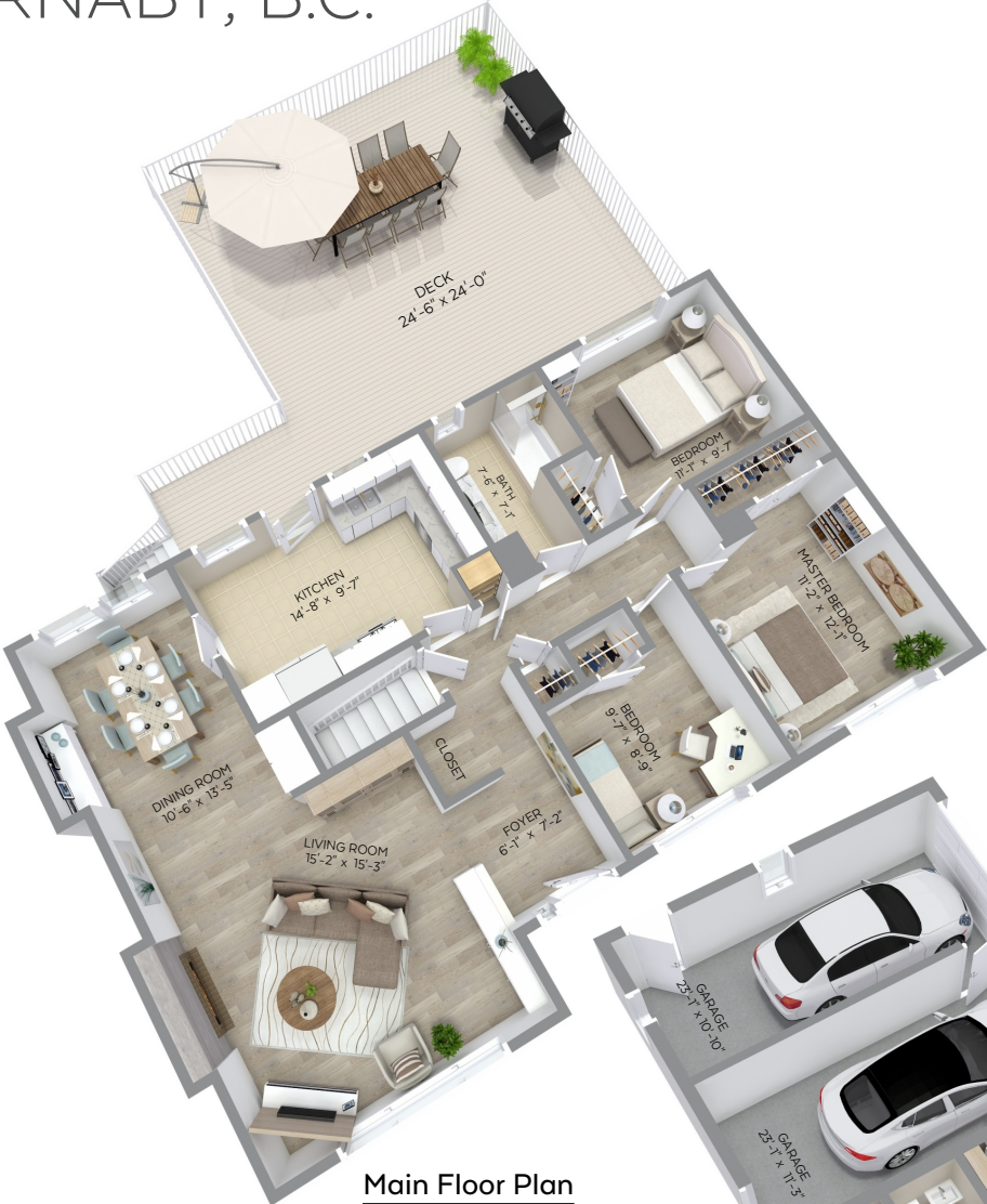
Main Floor Plan Floor Area: 1,205 sq.ft.