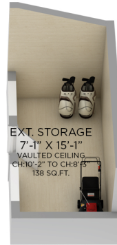
EXT. STORAGE 7'-1" X 15'-1" VAULTED CEILING CH:10'-2" TO CH:8'-5" 138 SQ.FT.