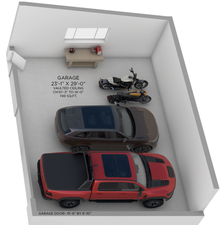
GARAGE 23'-1" X 29'-0" VAULTED CEILING CH:10'-3" TO 14'-0" 749 SQ.FT.