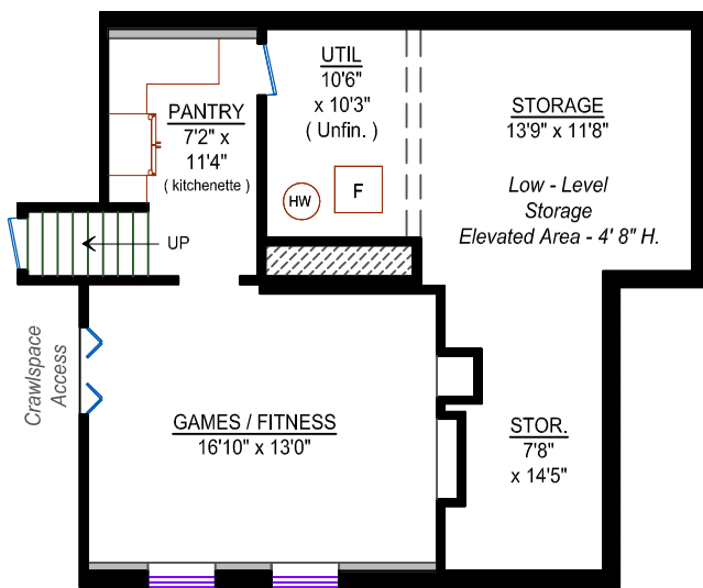
LOWER LEVEL Area: 86 sq. ft. (Unfin.) Area: 358 sq. ft. (Fin.) Area: 312 sq. ft. (Low-Level / Unfin.)